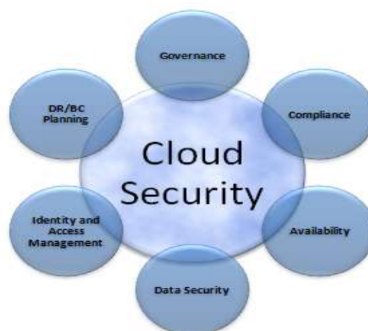
Fig- 2 Various Point of View of Cloud Security

In Cloud environment the security provided by customers using cloud services and the cloud service providers (CSPs).Security-as-a-service is a security provided as cloud services and it can provide in two methods: In first method anyone can changing their delivery methods to include cloud services comprises established information security vendors. The second method Cloud Service Providers are providing security only as a cloud service with information security companies.