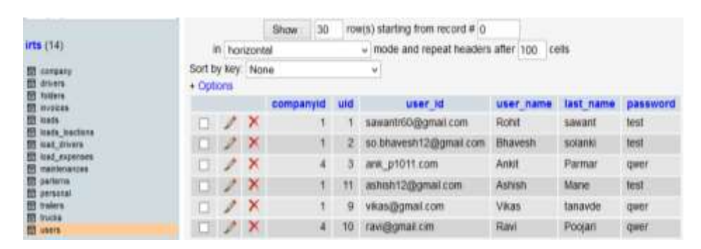
Fig. 3 Database table Entries

The following table shows the existing entries in the database: