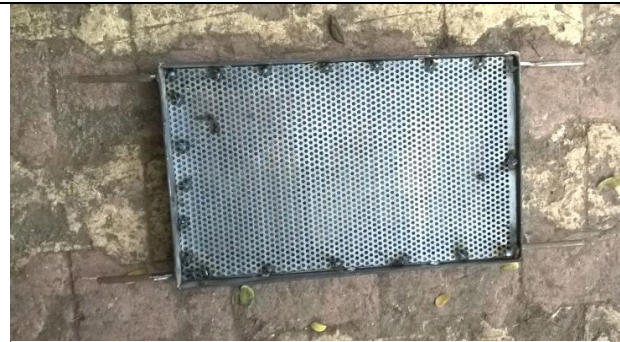
Fig. 5.3 Screen 2