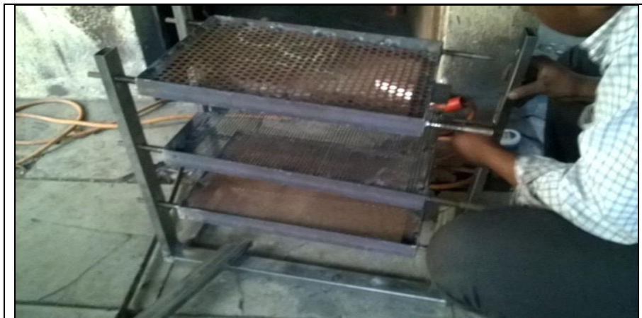
Fig. 5.5 Machine Set up