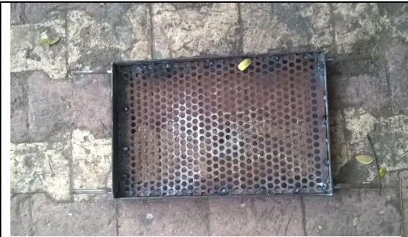
Fig. 5.2 Screen 1