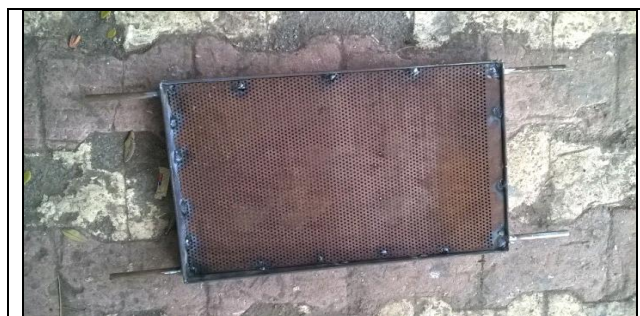
Fig. 5.4 Screen 3