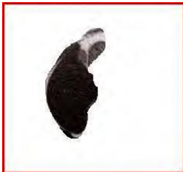
Figure 4: Segmented Tumour

The segmentation of the pre-processed image essentially affects the overall performance of any automated image analysis system. Image regions, homogeneous with respect to some usually textural or colour measure, which result from a segmentation algorithm are analysed in subsequent steps. Watershed segmentation on the other hand leads to over segmentation and hence the output does not appear meaningful. Figure 4 below shows the tumor after implementing our segmentation algorithm.