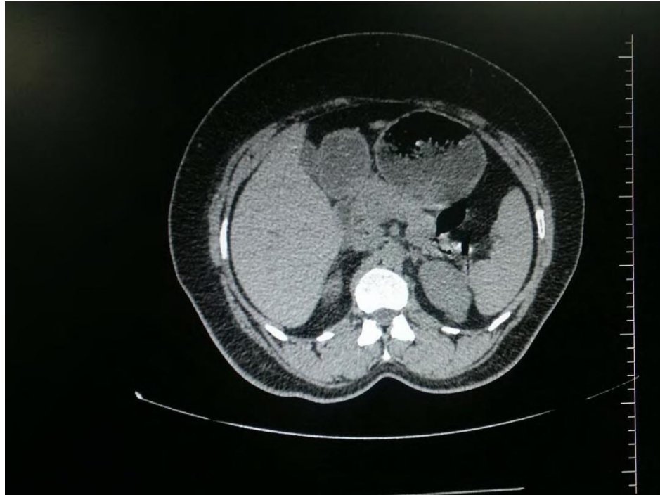
Figure 1: Image after converting to JPEG, cropping and filtering