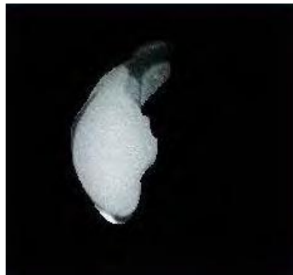
Figure 6: After Region Growing

We have used a simple region growing algorithm. This includes a simple region-based image segmentation method that is also known as a pixel-based image segmentation method since it involves the selection of initial seed points. We have used around 500 seed point and grown the image from those basic points to provide a 3 D image of the tumor for better visualization. This approach to segmentation examines neighboring pixels of initial “seed points” and determines whether the pixel neighbors should be added to the region. The process is iterated on, in the same manner as general data clustering algorithm. Figure 6 above shows the same.