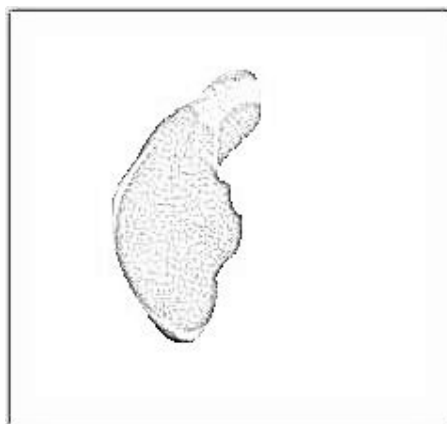
Figure 5: Tumour after edge detection for analysis

With the segmented tumor available it is not easier for us to analyse the tumor using various measures that could help decide the course of further treatment. The figure 5 below shows the tumor with edge detection technique implemented to calculate the visual appearance of patterns in terms of size, speculation, contrast, location, surface area, volume, colour, density and risk.