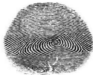
Fig.2. Fingerprint Image