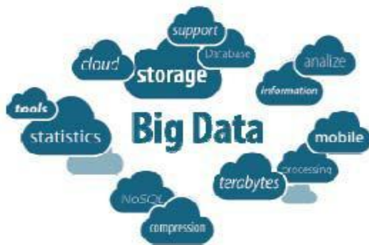
Fig 1: Big data

Fig 1 shows a typical bug data representation./ The areas for example that comes in big data are shown.