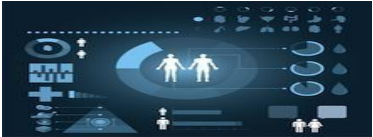
Fig. 2. Technology involved in health care segment.

Medical care and medically related research is becoming bigger and complex day by day and is resulting in huge volumes of data. All this is further propagated with the advent of new technologies. The aim to advance medical care and convert science into modern science is confined by the ability to process big data efficiently and effectively. The sources of data in medical science ranges from human genetics and pathogen genomics to routine clinical documentation, from internal imaging to motion capture, from digital epidemiology to pharmacokinetics and from treatment pathways to life course assessment [9].