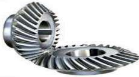
Fig-2: Bevel Gear

2.4 Bevel Gear: Two important concepts in gearing are pitch surface and pitch angle. The pitch surface of a gear is the imaginary toothless surface that you would have by averaging out the peaks and valleys of the individual teeth. The pitch surface of an ordinary gear is the shape of a cylinder. The pitch angle of a gear is the angle between the face of the pitch surface and the axis. The most familiar kinds of bevel gears have pitch angles of less than 90 degrees and therefore are cone-shaped[1]. This type of bevel gear is called external because the gear teeth point outward. The pitch surfaces of meshed external bevel gears are coaxial with the gear shafts; the apexes of the two surfaces are at the point of intersection of the shaft axes. Bevel gears that have pitch angles of greater than ninety degrees have teeth that point inward and are called internal bevel gears. Bevel gears that have pitch angles of exactly 90 degrees have teeth that point outward parallel with the axis and resemble the points on a crown. That's why this type of bevel gear is called a crown gear. Miter gears are mating bevel gears with equal numbers of teeth and with axes at right angles.