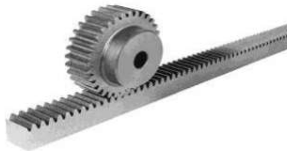
Fig-1: Rack and Pinion Pinion

1 Rack and Pinion: Rack The rack of the steering gear is a circular bar with teeth cut across a part of its length. The steps followed during the generation of rack are as follows: Developing a Virtual Prototype of a Rack and Pinion Steering (RPS) System