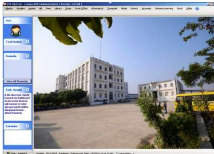
Fig. 5 Home Page