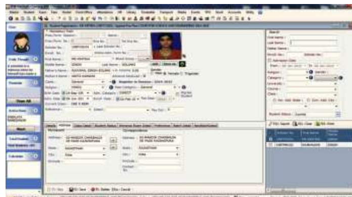
Fig.7 Student Module