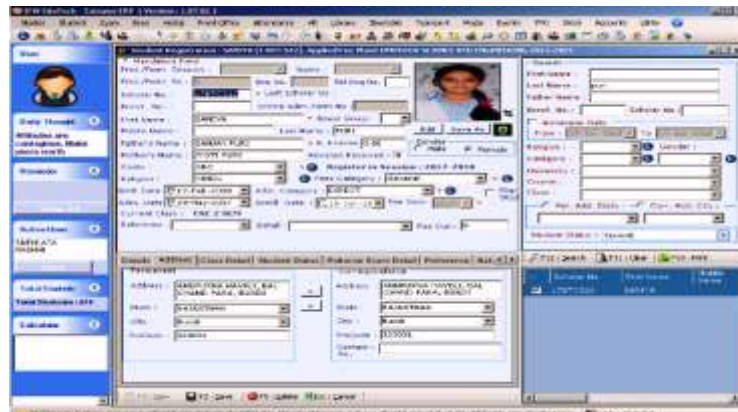
Fig. 7 Student Module

Admin can login to the System where they can add and update the student details in the database. The database contains student profiles, attendance, internal marks exam schedule and University grades. Parents can login to the system to view the details which are entered by server. Parents only view the details and not have update permissions.