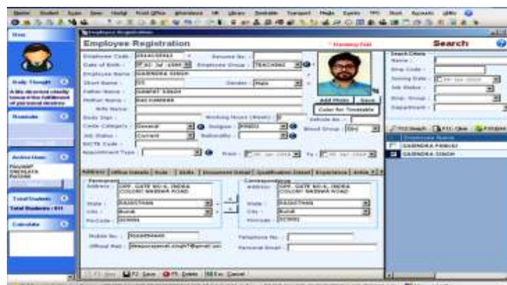
Fig. 6 Employee Module