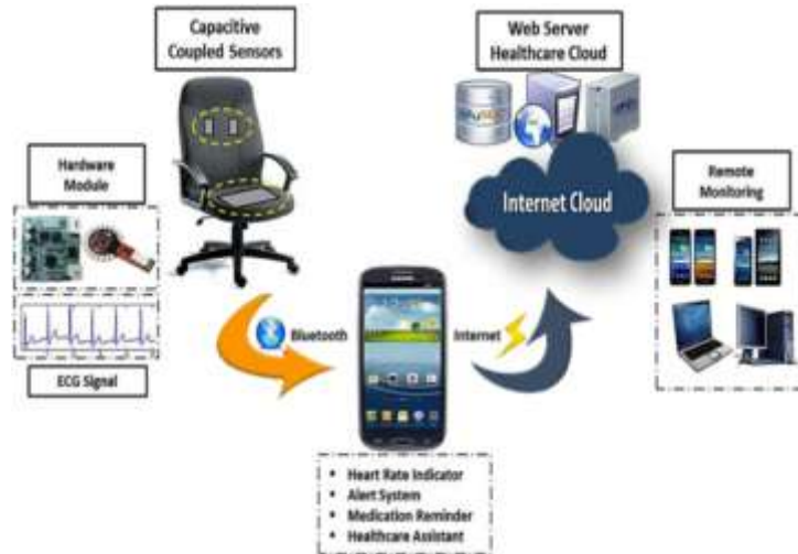
Fig. 4 System Architecture of ERP.