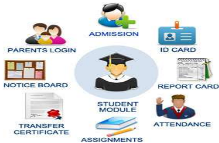
Fig 3 . ERP Module

The proposed system for college information system is fully an automated one using Wireless Android. In this system, we are using PHP Page for Admin side to maintain the student details. Admin can register the student details and requirements such as attendance, exam details are added into the database. Parents can login to the system as student name and then batch number as password.