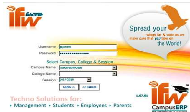
Fig 2- Registration Page