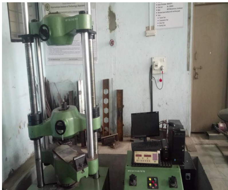
Fig.1: UTM Machine

In testing, we are going to see actual response of plates to stresses on standard testing machine.