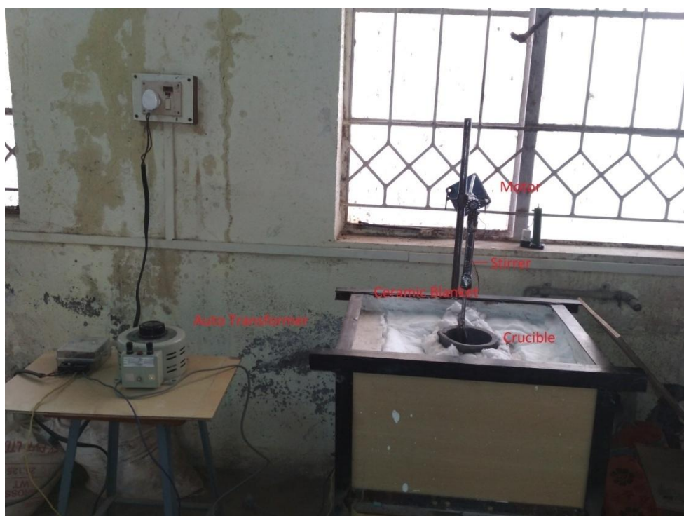
Fig.2 Fabricated Set up of Stir Casting Furnace

Crucible will be taken out of furnace by taking all the safety measures and molten metal will be poured into mold. Fig. 2 shows actual set up of stir casting furnace fabricated.