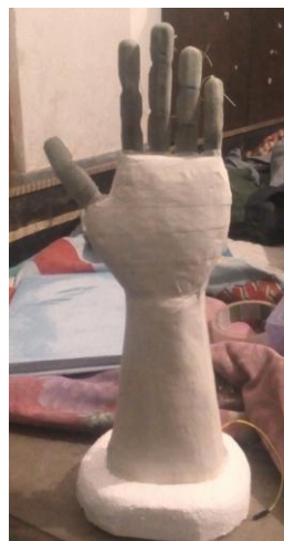
Fig3: The description of the limb hand as example of a modern prosthetic hand demonstrating the modular assembly and aesthetic appearance of currently available prostheses back side.

The report is done on various robot types: -