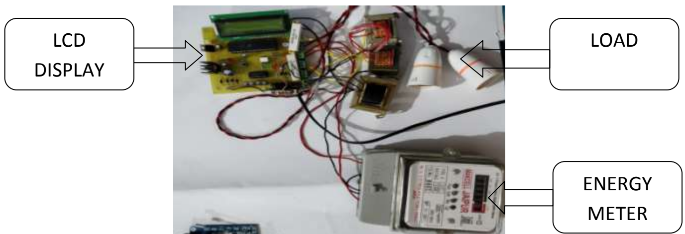
Fig.2 : Experimental setup

The following Fig.2 shows us the above operation