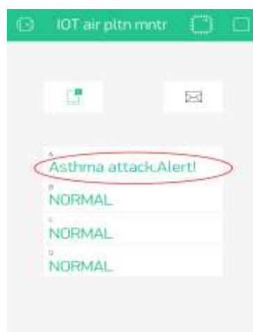
Fig3. Alert display in Blynk application when air contamination is above the threshold