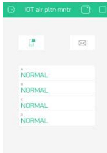
Fig2. Blynk application when air contamination is normal