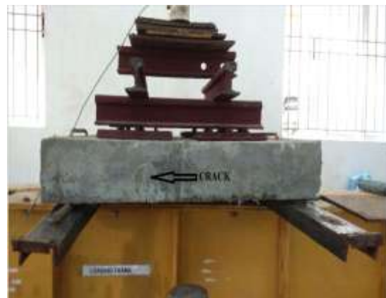
Photograph 3 Failure of bubble deck slab [11]