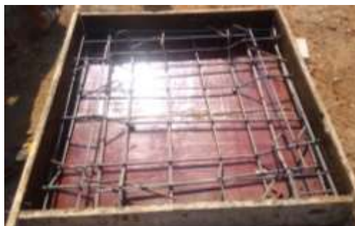
Photograph 1 Conventional slab

1. Conventional slab: This is a slab with specifications prepared to analyze experimentally with normal concrete of grade M20 by adopting conventional methods of design according to IS 456:2000.