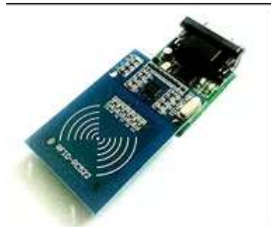
Fig.2 RFID Reader

2. RFID Reader: The unique digital data of tag is decoded with the use of RFID reader. The RFID reader transmits an electromagnetic wave which is input to the tag. RFID tag is energized due to these electromagnetic waves hence resulting in the production of a confined magnetic field, which has an interference pattern. This interference pattern which when read by a RFID reader would produce the unique number assigned to the RFID tag and thus the address of the tag is obtained. It should be noted that the address differs from each RFID tag as they are provided by EPC global and hence it offers complete resistance to duplication.