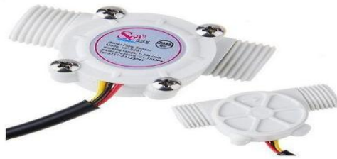
Fig 3 : Hall-Effect sensor