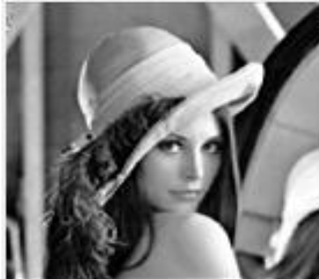
Figure 3: Intensity increased image

The above result (figure 2) shows the result after MRM and RPRM.