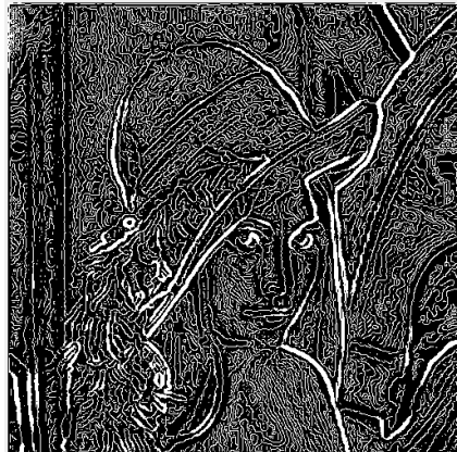
Figure 8: sobel and canny edge detection

Figure 8 shows the result of combined sobel and canny edge detection.