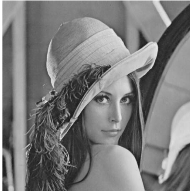
Figure 2: Image enhancement result obtained using MRM and RPRM.

The above image (Figure 1) shows the results obtained after MRM.