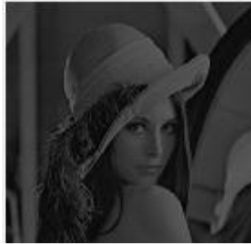
Figure 5: image sharpen

Figure 5 shows the image after sharpen the edges