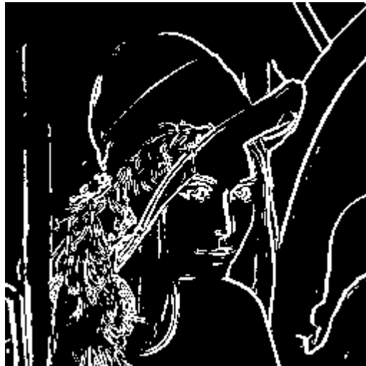
Figure 9: sobel edge detection without enhancement

Figure 8 shows the result of combined sobel and canny edge detection.