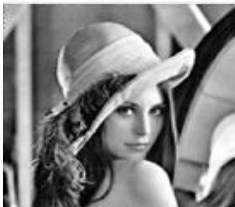
Figure 4: genetic algorithm

Figure 3 shows the image after intensity increase.