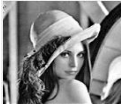
Figure 6: original image

Figure 5 shows the image after sharpen the edges