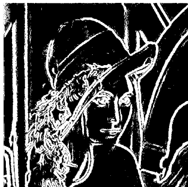
Figure 7: sobel edge detection

The above figure 6 shows the image before the contrast enhancement which shows the darker image, the improved version of which has been shown in the figure 5