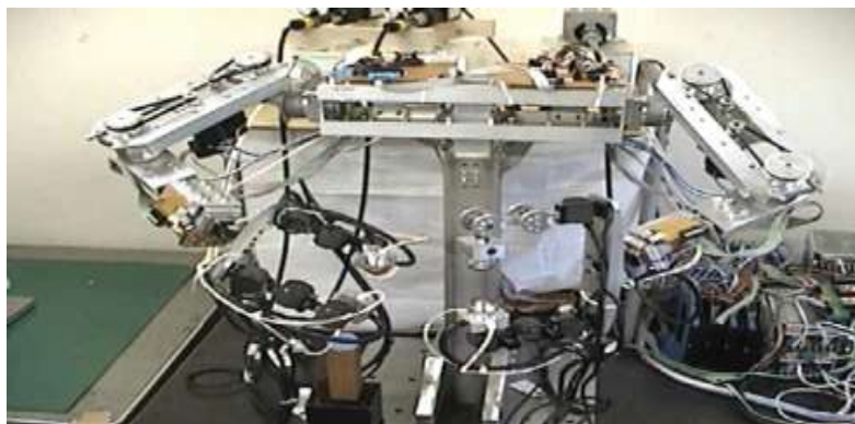
Fig. 2 Two-hand-arm robot equipped with optical three axis tactile sensor [10].