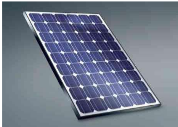
Fig.1 Solar Panel

supply electricity in commercial and residential applications. Each panel is rated by its DC output power under standard test conditions, and typically ranges from 100 to 320 watts. The efficiency of a panel determines the area of a panel given the same rated output - an 8% efficient 230 watt panel will have twice the area of a 16% efficient 230 watt panel. Because a single solar panel can produce only a limited amount of power, most installations contain multiple panels. A photovoltaic system typically includes an array of solar panels, an inverter, and sometimes a battery and or solar tracker and interconnection wiring.