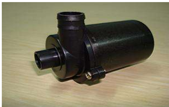
Fig.1 DC water pump

For people living in remote areas, solar water pumps are usually the only solution as there is no access to diesel. If there is diesel, Solar Water Pumps are the only solution or an excellent alternative for diesel as the cost of running power lines or diesel pumping may be too great.