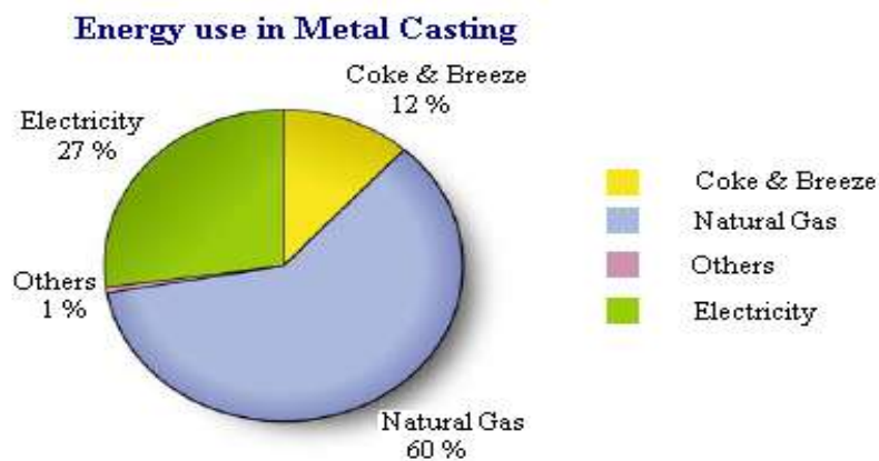
Figure 2: Source 2004 Metal Casting Annual Report

The industry spent $1.2 billion in fuels and electricity purchases alone in 1998. The concern over the energy efficiency of processes has been growing with the recent rising costs of energy. Factors like increasing energy demands, compounded by spikes in energy costs from world events will continue the upward trend in energy costs, pressing the need for developing energy-efficient solutions for the melting process.