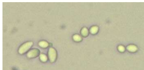
Figure. 3 Microscopic view of spray dried encapsulated cells (adapted from Both et al., 2012)

Encapsulation by spray-drying, freeze-drying or fluidized bed drying have shown their limitations because the cells encapsulated by these techniques are completely released into the product. Hence, the probiotic bacteria are not protected towards the food environment and in the presence of gastric fluid or bile [7]. This method is commonly used in food industry involves atomization of an aqueous or oily suspension of probiotics and carrier material into a drying gas, resulting in rapid evaporation of water. The spray-drying process is controlled by these temperatures, but also by the product feed and the gas flow [41]. Despite the advantages of spray-drying technique, the high temperatures needed to facilitate water evaporation reduce the probiotics viability and their activity in the final product. The minimum air inlet temperature reported in the literature for probiotic encapsulation is 100 °C while the maximum is 170 °C. The air outlet temperature varies between 45°C and 105°C. At these temperatures, it is unlikely that the cells retain all their probiotic activity.