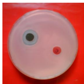
Fig.4 Zone of inhibition exhibited by CG3 against Gram +ve microorganism.