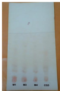
Fig.3 TLC sheet of test samples (M1, M3, M4 & CG3)