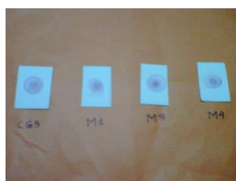
Fig.2 TLC strips with purple spots